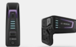
System Controller LED Remote

Unsure which eBike system you have? eBikes with smart systems have a System Controller or LED Remote.